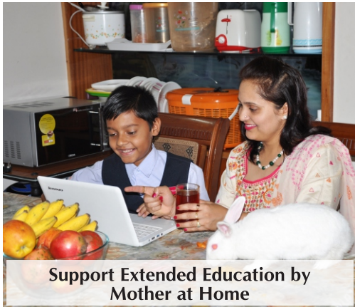
Support Extended Education by Mother at Home