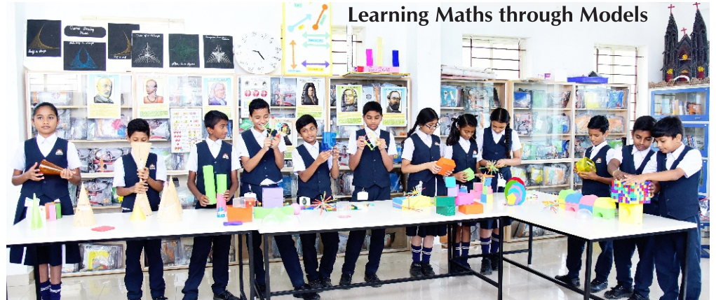
Learning Maths through Models