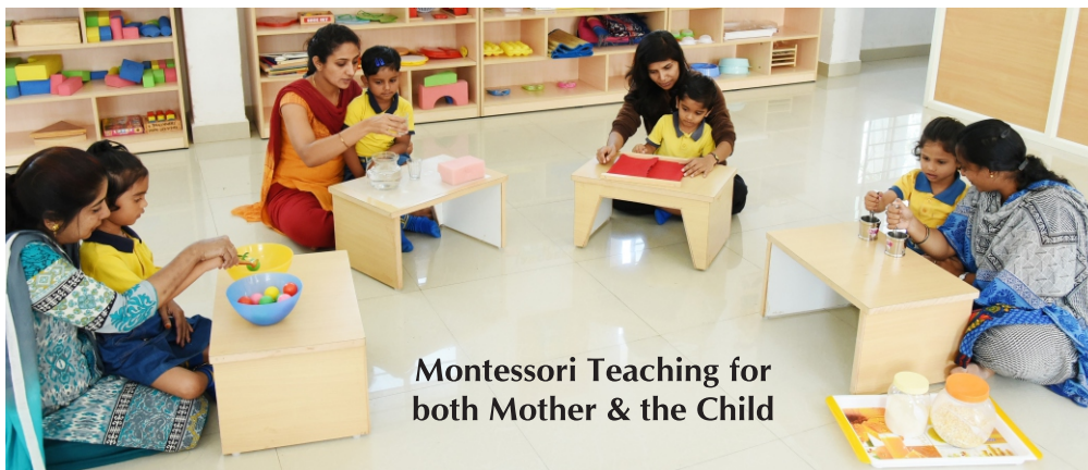
Montessori Teaching for both Mother & the Child