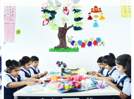
Developing Creativity in Students