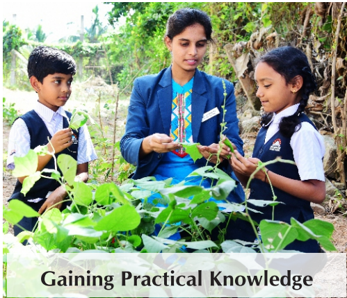
Gaining Practical Knowledge