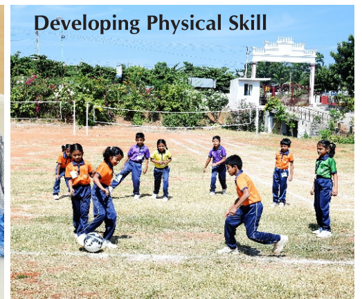
Developing Physical Skill