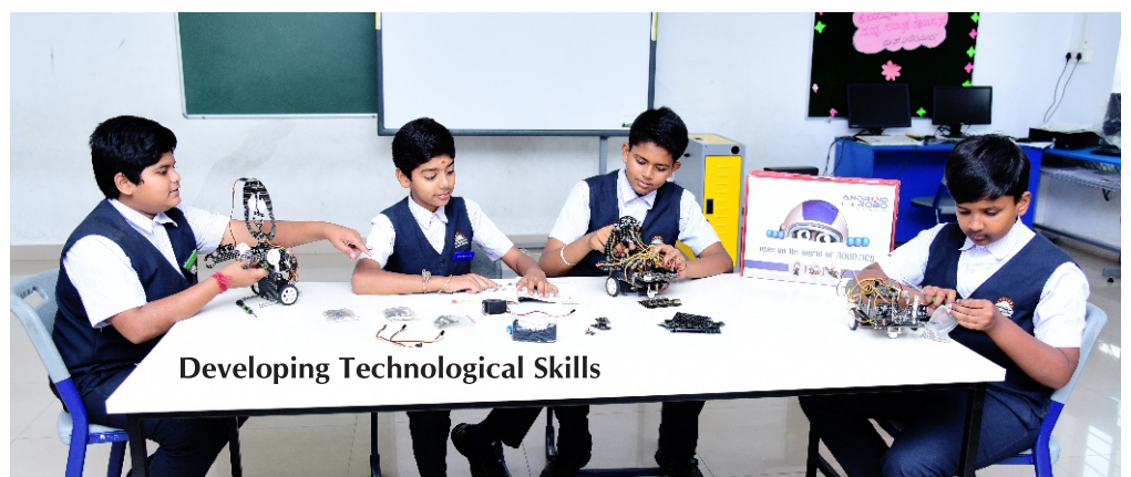
Developing Technological Skills