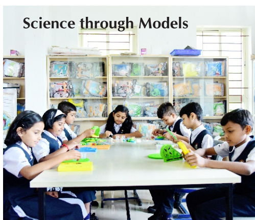
Science through Models