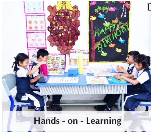
Hands - on - Learning